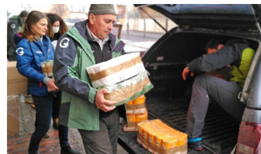
FZS partner project in Romania – Foundation Conservation Carpathia – load a vehicle convoy with food and other supplies destined for Ukraine.

people have sought refuge in and around protected areas in Polesia and the Carpathians