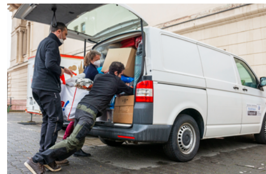
Equipment bound for Ukraine is loaded into a vehicle in Frankfurt.

Please note: The situation in Ukraine remains unpredictable. Should you be contacted by the press regarding coverage of support to protected areas in Ukraine please contact crisiscommunication@fzs.org for further guidance. For all other questions please visit: www.fzs.org/en/service/contact .