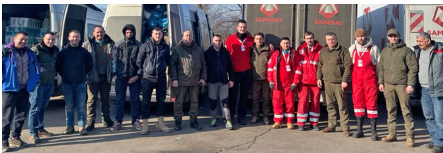
Ukrainian protected area staff collect a batch of supplies at the border – sent from Romania, with the support of Sameday logistics.