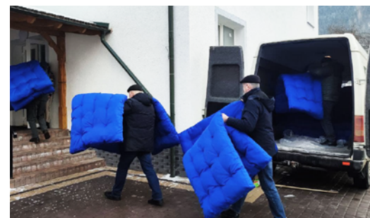
Mattresses purchased by FZS Ukraine are delivered to park infrastructure converted to lodge IDPs in the Carpathians.