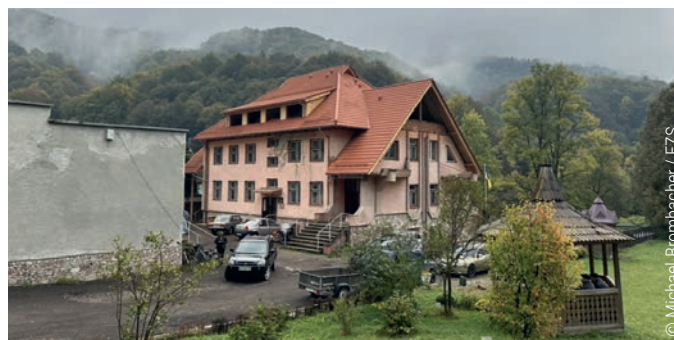
The main administrative building in the Carpathian Biosphere Reserve is currently being renovated. It had a leaking roof which was repaired and replaced.