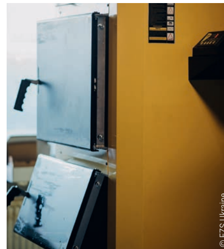
The new boiler installed in Hutsulshchyna National Park after the old one suffered catastrophic failure at the onset of winter.

Operational costs encompass not only the predictable and routine needs of protected areas. Therefore, FZS also provides financial support for urgent and critical requirements. One example in winter 2023 was the unexpected failure of a heating system in the administrative building of the Hutsulshchyna National Nature Park. The wood boiler and associated heating system components were replaced just before the onset of cold weather, enabling 54 staff members to continue their essential day-to-day work.