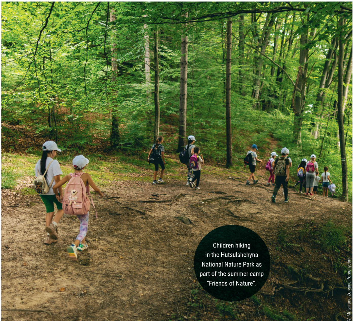
Children hiking in the Hutsulshchyna National Nature Park as part of the summer camp “Friends of Nature”.

In Summer 2023, staff of the Hutsulshchyna National Nature Park hosted a three-day nature camp called “Friends of Nature”. This was the second year in a row that FZS has supported the event, which allows children to visit different parts of the national park, and to study and explore the environment through challenges, creative tasks, and sports activities. Young visitors also got acquainted with the park’s nature trail and learned about local flora and fauna, with particular emphasis placed on the importance of nature conservation and nature-friendly behaviour. The camp also provided an opportunity for children to take a break from the daily challenges and traumas of living in war time in Ukraine. FZS’s operational cost support to the park covered the transport, food and materials needed to make the event possible.