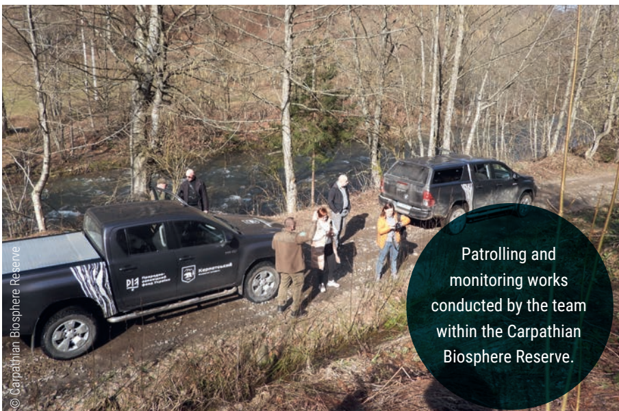
Patrolling and monitoring works conducted by the team within the Carpathian Biosphere Reserve.

Provision of fuel constitutes one of the main recurrent expenses covered by FZS for protected areas in the Ukrainian Carpathians. During 2023, parks and reserves received operational support of nearly 38,000 liters of fuel, enabling staff to carry out essential field-based activities, including routine patrols, environmental monitoring, eco-education activities, and the maintenance of infrastructure. This support is critical in enabling specialists in protected areas to carry out daily conservation work and specific on-site activities.