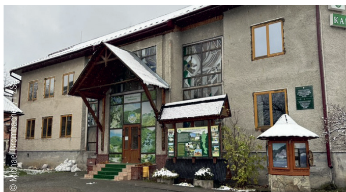
The administrative building of the Carpathian National Nature Park in the city of Yaremche has been renovated. New energy saving and wooden windows have been installed and the outer walls have been insulated. The renovation has significantly reduced the national nature park's energy costs. Currently the heating pipes and the radiators are being modernised and the office rooms renovated.