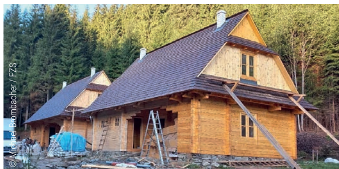
New high quality and ecological ranger houses constructed in accordance with traditional architectural practices were built in Ukraine's Verkhovynskiy National Nature Park, near the Romanian border. A second building functions as a guesthouse for tourists.

Ranger houses, administrative buildings, and museums and information centers of protected areas in the Ukrainian Carpathians are mostly housed in aging buildings that lack insulation, have poor energy efficiency, and may have other major issues such as leaking roofs, which endanger the buildings and the people working and living in them. FZS undertook a massive overhaul of key buildings in the Carpathians, including the construction of new ranger houses that adhere to local ecological and traditional styles, as well as new guesthouses that offer places to stay for people seeking a rest from the war as tourists. By this, parks can also generate income.